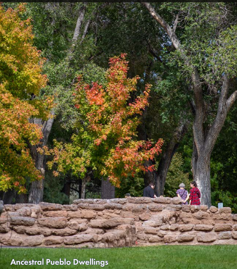
Ancestral Pueblo Dwellings